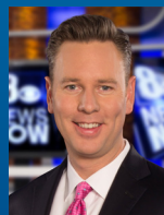
Brian Loftus Evening News Anchor, 8 News Now